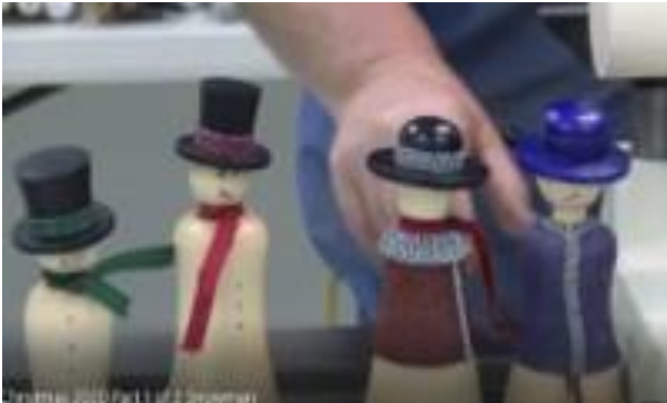
(Midsouth Woodturning Guild, 2020)